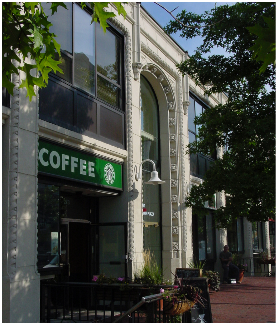
Huntington Avenue Facade