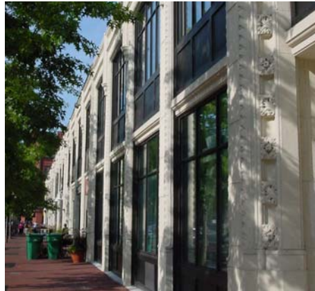
Huntington Avenue Facade

The food services work has been done for the management company, and for the Burger King franchise, and for the Panera Bread franchise. Additional work has been done for offices on the upper floors.